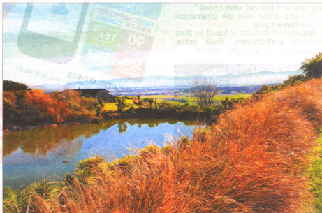
APPEALING: The grasses and pond give the gardens an almost rustic charm.

Or if you're a gardening fan why not visit Assisi during the Pukaha Mount Bruce Wairarapa Garden Tour on November 9 and 10. To pre-register for tickets email info@pukaha.org.nz .