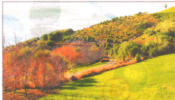
FIRST GLIMPSE: The 1.5km driveway meanders through the gardens as you climb to the house.

amazed to hear wild bees and a host of tui.